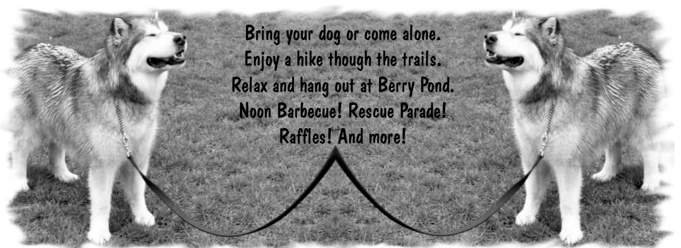
Only dogs with proof of rabies vaccination are permitted to attend and all dogs must be on leashes. For more information, please visit our web site at <a href="https://www.amrone.org">www.amrone.org</a>.

At beautiful Berry Pond Harold Parker State Forest North Andover, MA