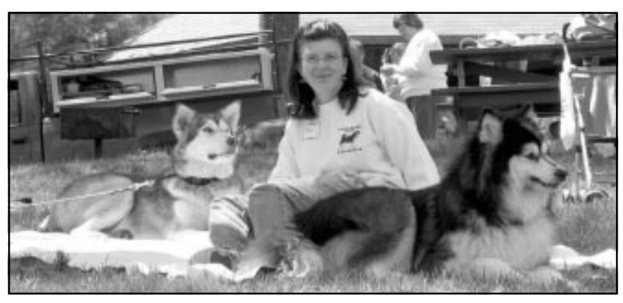
When adoption is done right, it's a happy result.