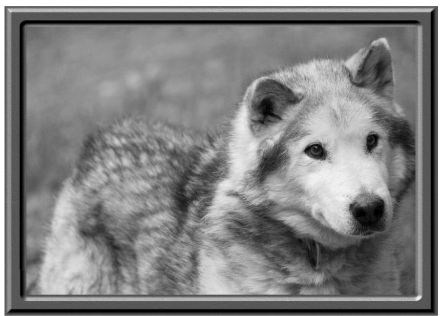
Jacques will be remembered as a good sled dog.