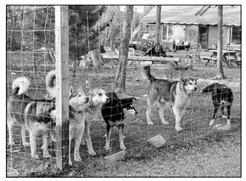
Some of the dogs at Wandering Spirits Kennels. They are almost all former shelter residents and currently are part-time working dogs and full-time spoiled pets.

I order dog food by the ton twice a year. I am very nice to the local