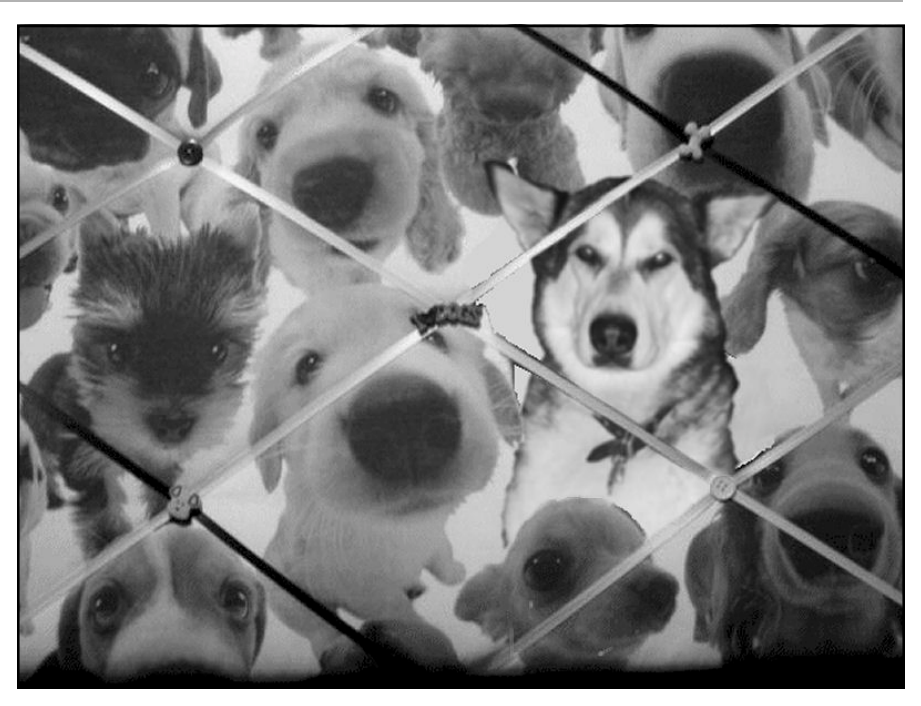
There are thousands of homeless dogs waiting to be adopted.

about what breed to buy now so you don't have to get rid of your dog when you have a baby on the way.