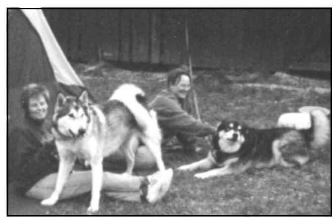
Getting into the spirit, these two campers are ready to enjoy the weekend with their dogs.

Many people did arrive on Friday night so they wouldn't miss any of Saturday's activities, which began at [Continued on Page 4]