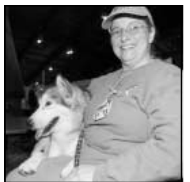
The afternoon options also included a hands-on problem-solving session, jewelry making, baking more goodies and Canine Good Citizen testing. There was also plenty of free time for everyone to enjoy the camp, walk the trails, talk with friends and rest by the fire.