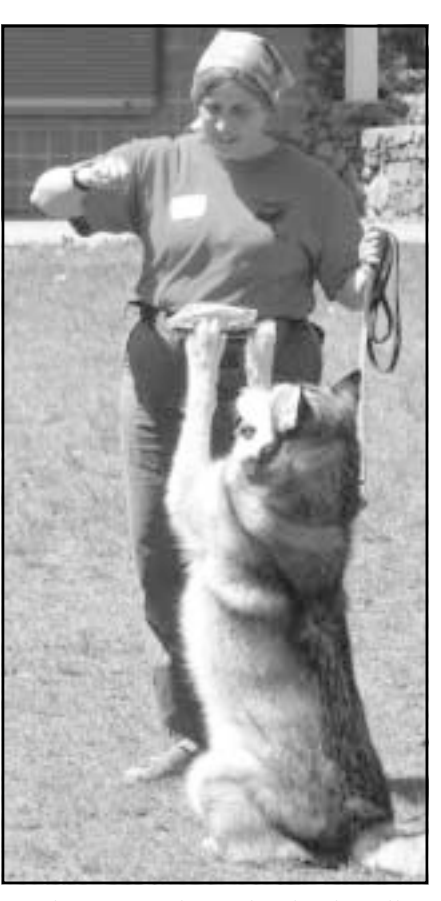
Faith: versatile and a little silly.

Black Ribbon — AMRONE sends its condolences on the loss of Bear shortly after this note was received.