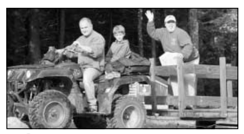
Thanks to everyone who helped and supported Camp N Pack. See you next year.