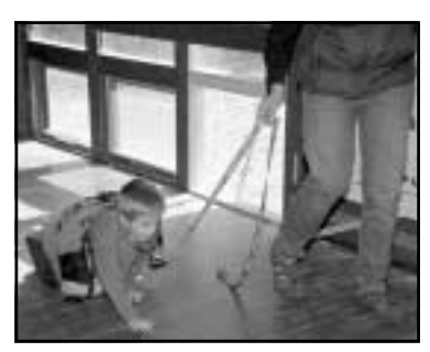
OK ...some people entered any dog that was available.