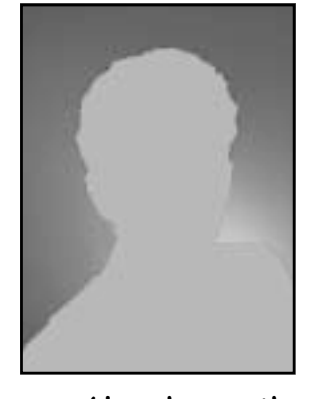
The person/dog who won the adult division of the Super Dog Challenge. Unfortunately we were unsure of who this was (we couldn't find the score sheets) but if you let us know we will be sure to get you into the next newsletter.