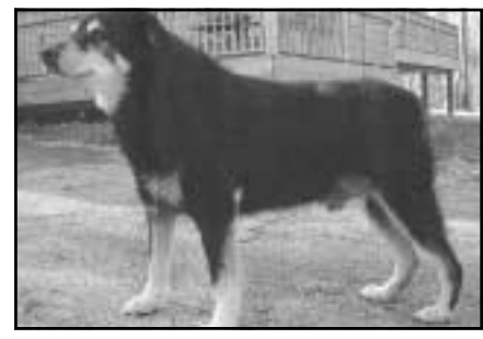
Bear: amazing for his age.

The funniest thing that ever happened with her was in agility when she decided that tunnels were too much fun and raced around the course doing the tunnels instead of the course. She looked at me, looked at the tunnel, looked at me (and the obstacle / was sending her to) then said, "Oh well, just gotta do the tunnel!"