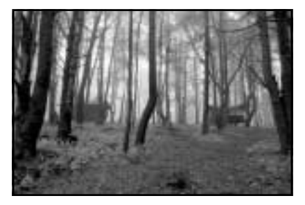
The 12th annual Camp N Pack was fun and relaxing this year. Everyone had a great time with their dogs. Most of our campers enjoyed themselves despite the wet weather. The dogs didn't seem to mind either.