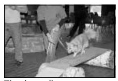
The dog walk