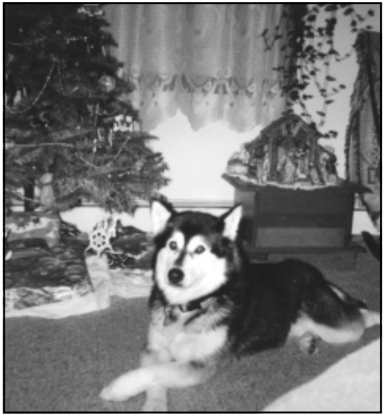
Cicely is loved by the Keppel family.

Some people worry that fostering will affect their own dogs. In our experience fostering is usually not a problem when foster dogs are handled sensibly and carefully. This includes keeping rescue dogs separate from your own dogs until the foster dog's health can be verified to be free of anything contagious, and until the dogs can be introduced slowly and carefully. Some foster homes always keep foster dogs separate from their own dogs, some foster homes integrate foster dogs into their households. If you do not want to foster a dog until it has had a vet check, vaccinations