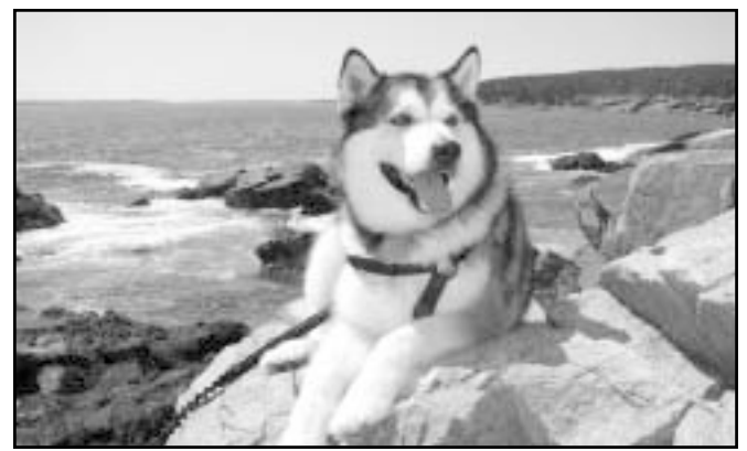
Yukon the cover dog could take Yukon. We used much of our vacation days on the road and worked seeing clients at home while my mom, his grandmother, watched him during the days.

I am attaching the photo I took and ironically enough, we just made our way back from this same location a couple weeks ago. We took Yukon up to Acadia, ME, again this summer to these same rocks, took him windjamming and to his favorite dockside restaurant for lobster tails and scallops — 6,050 miles in 15 days, all so we