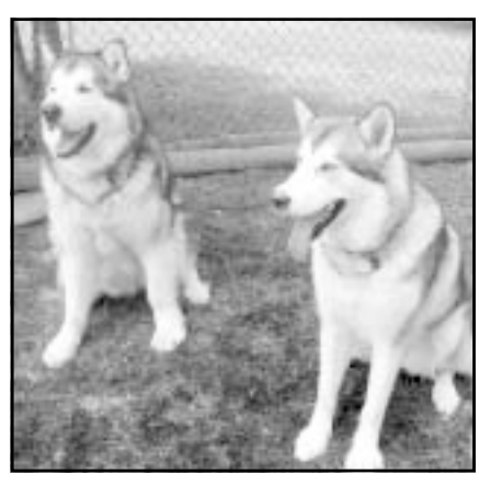
Shadow, left, and Abby

We have a big yard to play and run around in and a dog door that goes right into the house — I love that! Dad and Mom take us out for walks three times a day. At 5 in the morning we have our first walk of the day with Dad, I love it because I get to sniff out